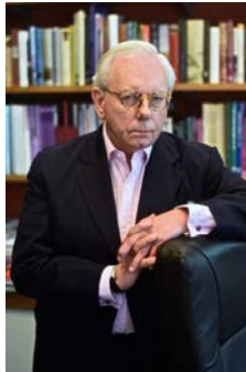
David Starkey 'A Monarchy of Misfits' Wednesday 1 May 7.30pm Armstrong Hall