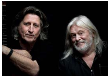
Show of Hands Thursday 2 May 7.30pm Armstrong Hall