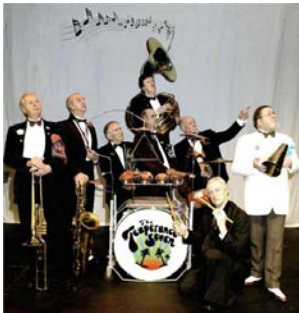
Temperance Seven Friday 3 May 7.30pm Armstrong Hall